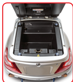
Under Seat Storage

Soar into Adventure with the Pride® Raptor!