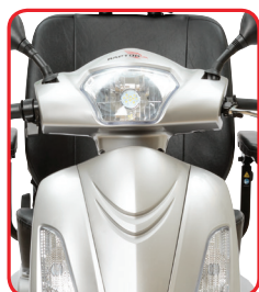
Front LED Light Package