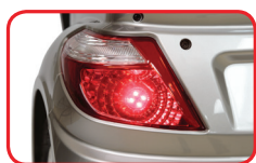
Rear LED Light Package